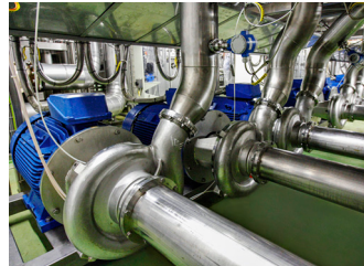
In the first conversion phase, a total of 16 Packo centrifugal pumps type MFP 3 with a capacity of 90 kW were installed