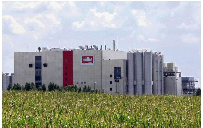
The Whey V-building of the Sachsenmilch plant in Leppersdorf

A considerable sum was used to build facilities for whey processing, which currently employs around 160 people. This independent business unit has been set up since 2002 in several steps. The Whey V section, which was commissioned in April 2016, stands for the production of lactose according to the Dry Mix standard for use in the baby food industry.