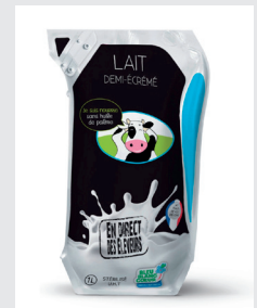
Award Winner: Ecolean Air Aseptic 1000ml French dairy producer En Direct Des Éleveurs won two prizes at World Dairy Innovations Awards in Dublin.

Ecolean Air Aseptic 1000ml not only provides a flexible and lightweight package for French consumers, with a unique QR code the French dairy producer also makes it possible to trace which farm the milk has originated from. The high-quality milk from En Direct Des Éleveurs – rich in Omega-3 and free from palm oil and GMOs – is currently sold individually or in a multipack of six units, in over 260 supermarkets and hypermarkets throughout western France. In 2016, the company's milk in Ecolean Air Aseptic was awarded the Innovation Award of Dairy Products at SIAL Paris – the world's largest food innovation exhibition.