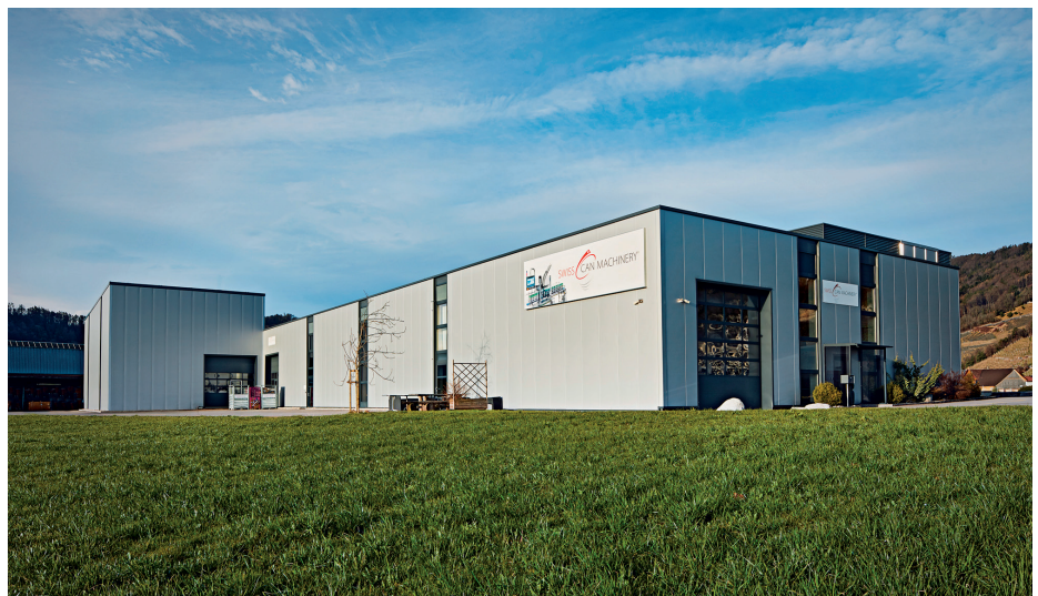
The new company headquarter is situated at Berneck, Switzerland.

It is not amazing that the Swiss enterprise is extremely export-oriented. The foreign sales sum up to more than 90 per cent of the turnover. Meanwhile there exist about 20 representations worldwide, since a couple of months even in Australia. Beside Europe the Asian area is a constant growing market. Moreover, a first line has just been delivered to Africa.