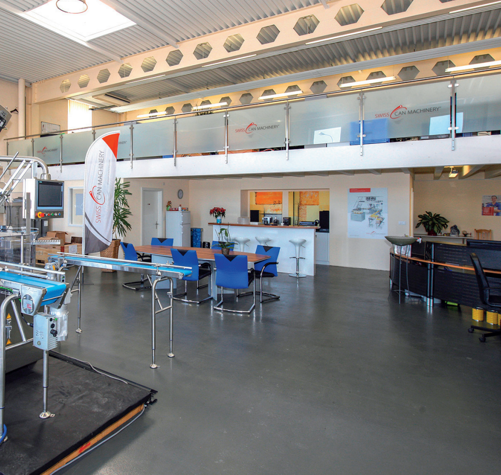
Constantly several machines are demonstrated in the show room.

offered. With the help of these innovative gassing systems cans with less than 0.5 and accordingly 2 % residual oxygen can be produced. The name of the first mentioned model range indicates the additional function of evacuating, so that the V-Matic combines three steps of processing: evacuating, aerating and seaming.