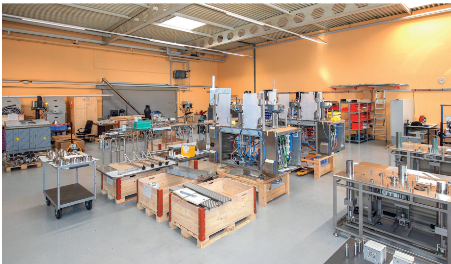
View into the production area.

The other production programme of Swiss Can Machinery AG includes semi-automatic can seaming machines, empty can cleaning and disinfection machines and cappers including lid destacker, for example. Moreover, conveyors and additional transport equipment are offered. ▲